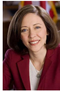
Senator Maria Cantwell

House Select Committee on Strategic Competition between the United States and the Chinese Communist Party