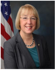
Senator Patty Murray

(Raquel Ferrell Crowley, Office of Senator Patty Murray - Central Washington Director, U.S. Senator Patty Murray, presenting)