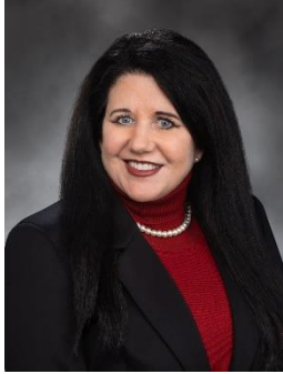
Representative Gina Mosbrucker– 14 th Legislative District.