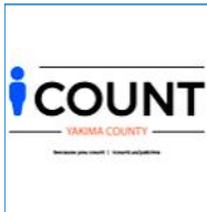
Homeless Point-in-Time Report