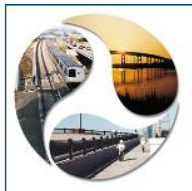
Transportation: Call for Projects