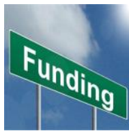
YVCOG Grant Program