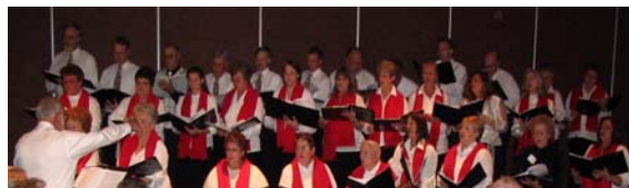
Zillah Community Choir performing at December 12 YVCOG General Membership meeting at the Yakima Convention Center.